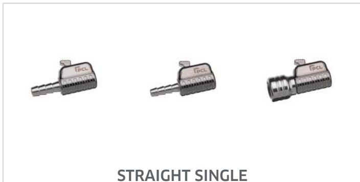
STRAIGHT SINGLE CLIP-ON CHUCKS

No expense was spared on materials of construction. These new units are manufactured using only the finest zinc alloy, aluminum and brass. The new air connectors boast a vice like grip and easy operation, with a simple, yet effective thumb push button, which quickly releases the tire valve, thus increasing efficiencies.